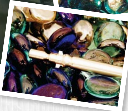
◀ This difficult-to-outsource stainless steel spinal surgery fitting was machined to 0.001" tolerance at PMMI on the Tsugami SS20.

sub-spindles. Rapid traverse is a fast 1,260ipm (32mpm), the main spindle speed is 10,000rpm and tool spindle speed is 5,000rpm. The SS Abile CAD/CAM software uses a simple building block concept for part design and is standard with the machine. Also standard is a dual path Fanuc 31i-A CNC system that greatly reduces cycle time by permitting true simultaneous operation of the main and sub-spindles.