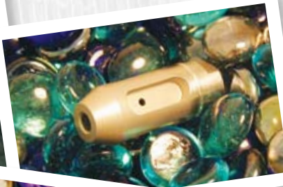
▲ Four setups were reduced to one for this stainless steel curette handle at PMMI on the Tsugami SS20.